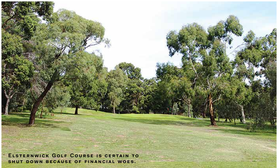
ELSTERNWICK GOLF COURSE IS CERTAIN TO SHUT DOWN BECAUSE OF FINANCIAL WOES.

Industry expert Jeff Blunden estimates there are the equivalent of 31.5 golf courses (18-hole equivalents) on government-controlled property in Sydney. All of these courses on council/crown/utility land will be hoping to avoid the fate of Parramatta Golf Club, which closed in 2015 after suffering a dramatic fall in revenue due